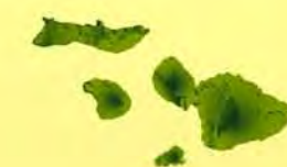
Hilton Waikoloa Big Island of Hawai'i